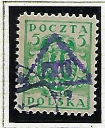
5h: bright green