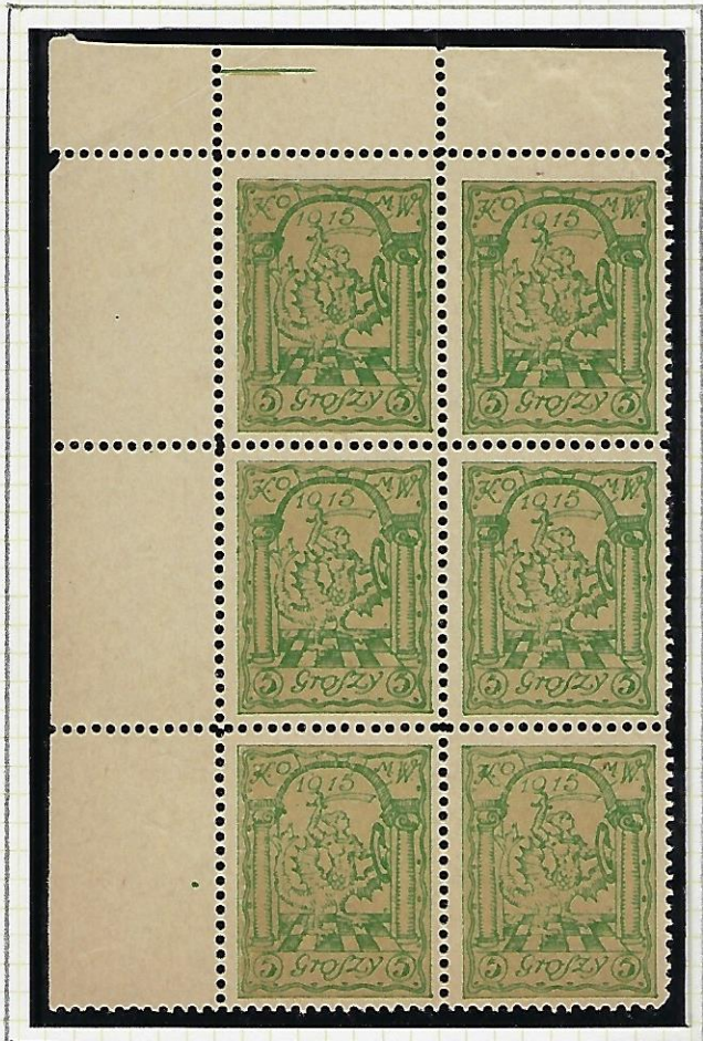
Warsaw No. 1 c.