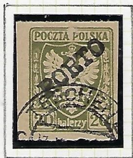
20h: olive-green (yellowish paper)