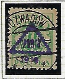
5h: bright green