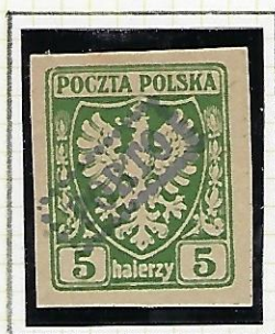
5h: bluish green (yellowish paper)

Issued by Kraków-14 Post Office. Overprints by rubber hand-stamp in black. Official.