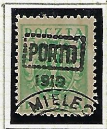
5h: bright green