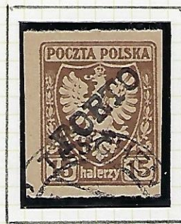
15h: brown (yellowish paper)