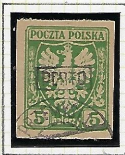
5h: bluish green (yellowish paper)

Issued by Przemyśl I Post Office. Overprinted with rubber hand-stamp in black. Imperforate, un-gummed. Official?