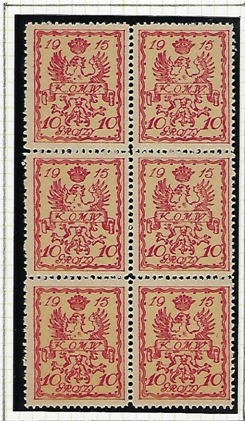
Warsaw No.2 .