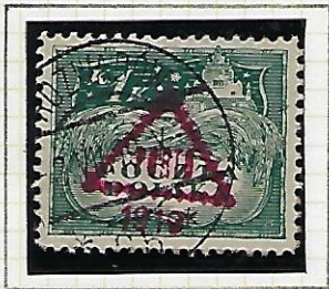
1 k: green (overprint red) un-authorized?