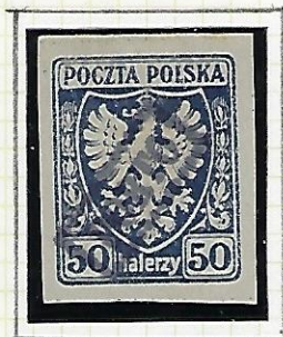
50h: dark blue (blue-tinted paper)