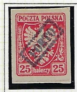
25h: carmine-vermilion (blue-tinted paper)