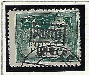
1 k: green