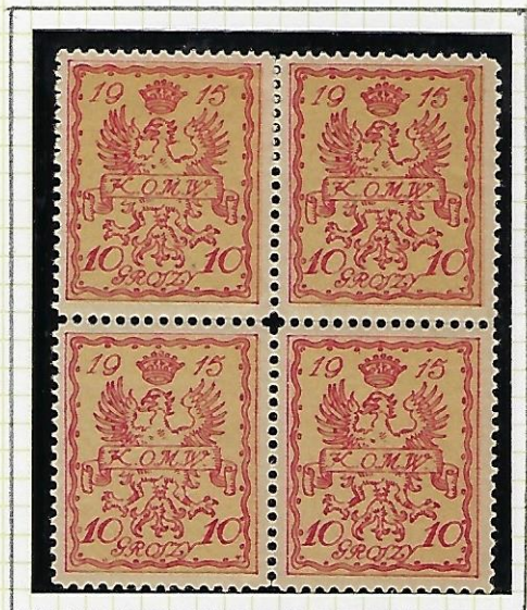
Warsaw No.2 .