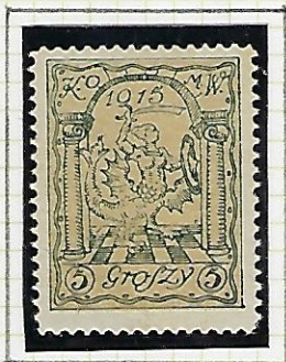
5 Groszy grey-green on sand-coloured: Warsaw's Syrene (Symbol of City's Coat of Arms).

19 Sept. 1915: Experimental Edition, Not Issued. Heraldic subjects, designed by E. Trojanowski and printed litho by Jan Cott's Printing Works, Warsaw, on medium, white paper. No watermark. Line Perf. 11½. Printed in sheets of 8 x 5 stamps.