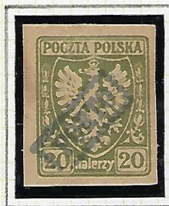
20h: olive-green (yellowish paper) (R-91)