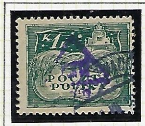
1 k: green

Note: There are also some values and overprint colours which are somewhat controversial (see next page).