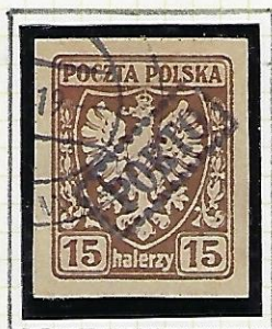
15h: brown (yellowish paper)