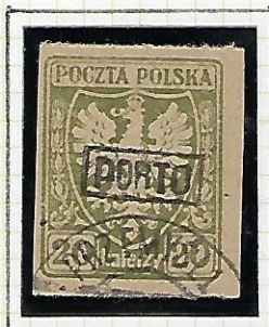
20h: olive-green (yellowish paper)