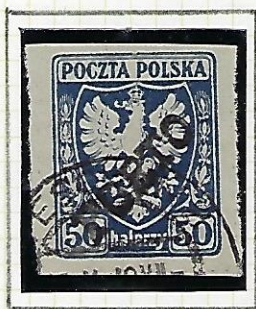
50h: dark blue (blue-tinted paper)