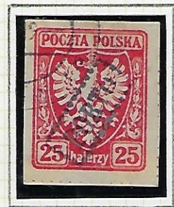
25h: vermilion (blue-tinted paper)