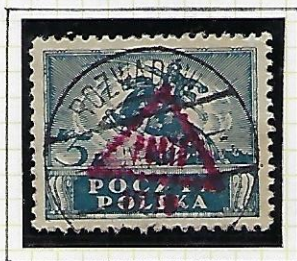
5k: grey-blue (overprint red) un-authorized?