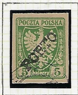
5h: bluish green (yellowish paper)

The second of 4 overprints made at Cieszyn - 2 Post Office, in black, with a rubber hand-stamp.