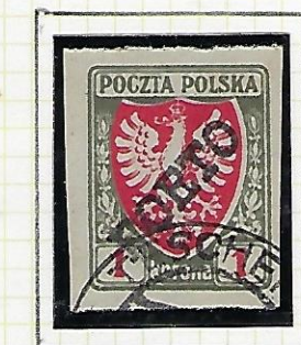
1k: grey & red (blue-tinted paper)