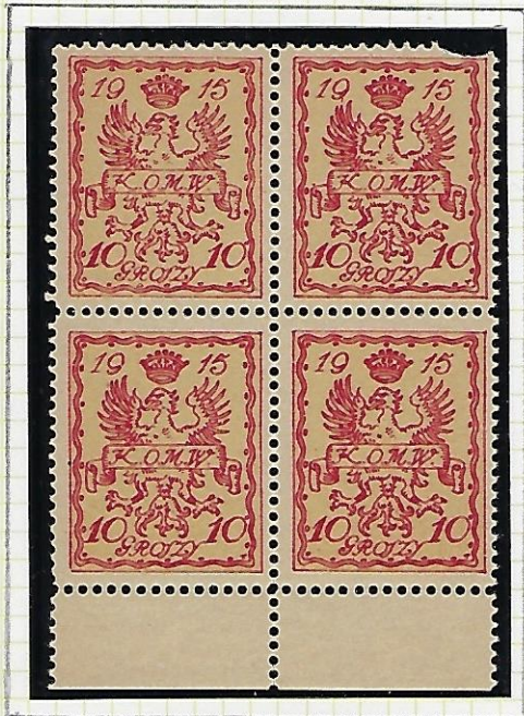
Warsaw No.2 . Topright corner of block damaged