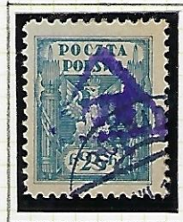
25h: pale blue