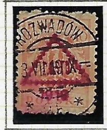
10h: yellow (overprint red) un-authorized?