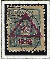
25h: pale blue (overprint red) un-authorized?