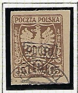
15h: brown (yellowish paper)