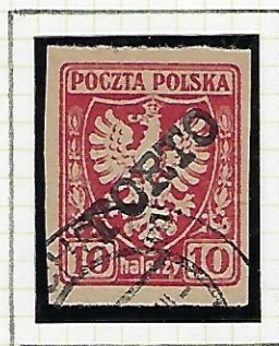
10h: carmine (yellowish paper)