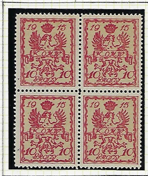
Warsaw No.2 .

The 10 Gr. Warsaw No. 2 stamp; Blocks - shades.