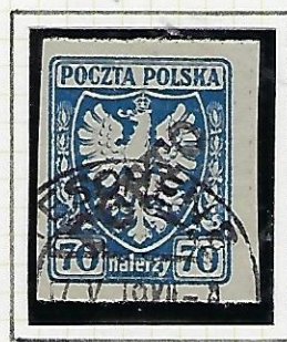
70h: light blue (blue-tinted paper)