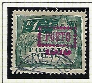
1 k: green (overpt. red)