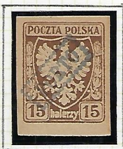
15h: light brown (yellowish paper) (R-91)