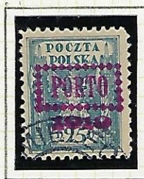
25h: pale blue (overpt. red)