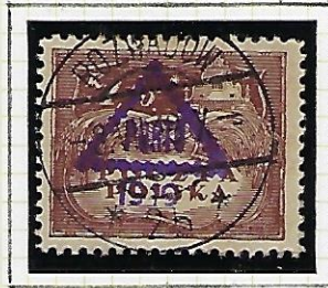
1.50k: brown Controversial value