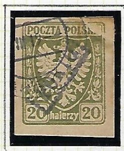
20gr: grey-green (yellowish paper)