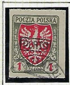
1 k: grey & red (blue-tinted paper)