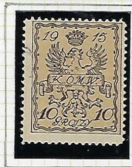
10 Gr. brownish black on sand-coloured: Crowned White Eagle (Polish Coat of Arms).

Certified by Lesław Schmutz, ZO PZF w Rzeszowie, as being Warsaw Ia. * *