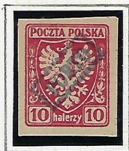
10h: carmine (yellowish paper)