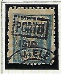
25h: pale blue