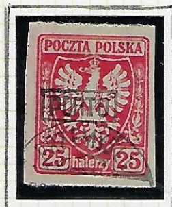
25h: vermilion (blue-tinted paper)