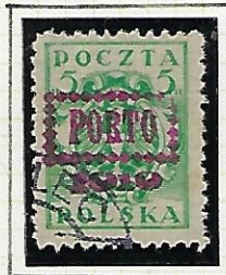
5h: bright green (overpt. red)