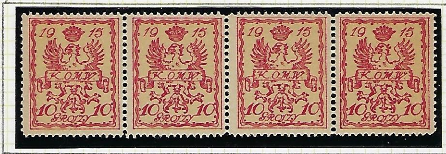
Warsaw No.2 .