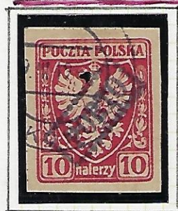
10h: red (yellowish paper) (damaged stamp)