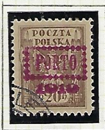
20h: grey-brown (overpt. red)