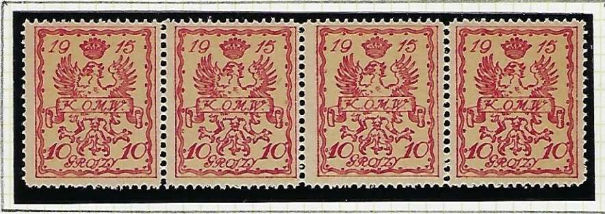
Warsaw No.2 .

The 10 Gr. Warsaw No.2 stamp; Strips and Blocks; shades.