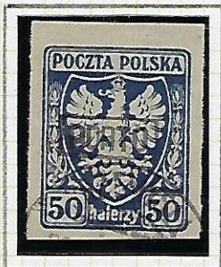
50h: dark blue (blue-tinted paper)