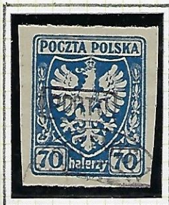
70h: light blue (blue-tinted paper)