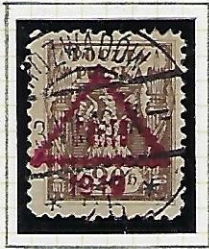
20h: grey-brown (overprint red) un-authorized?