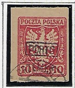
10h: carmine (yellowish paper)