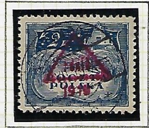
2k: deep blue (overprint red) un-authorized?