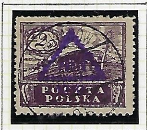
2.50k: purple Controversial value