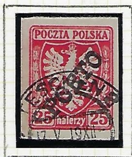
25h: vermilion (blue-tinted paper)